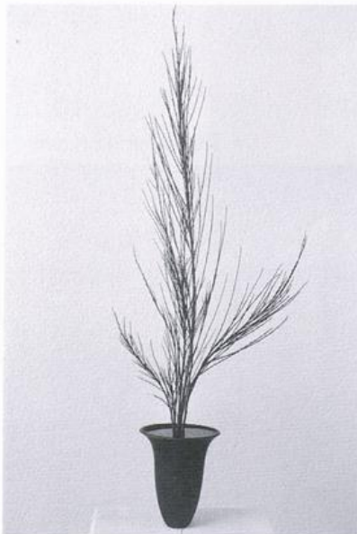
◦ Beatrice Löhner