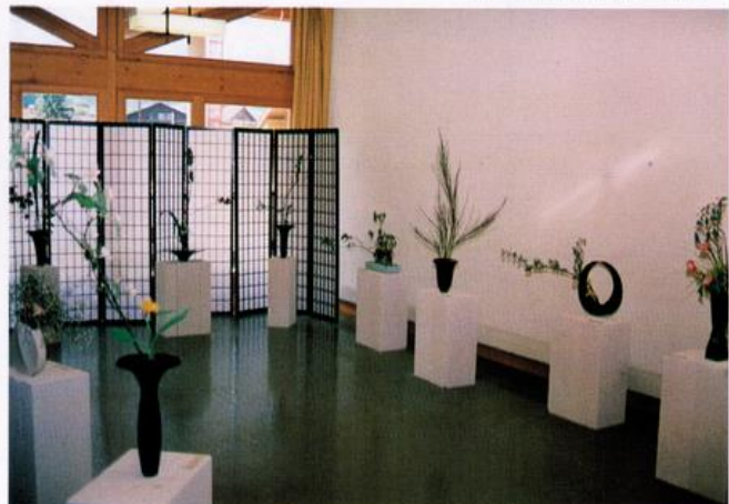
◦ The exhibition site