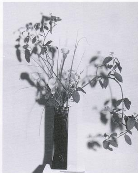
◦ Romy Studer