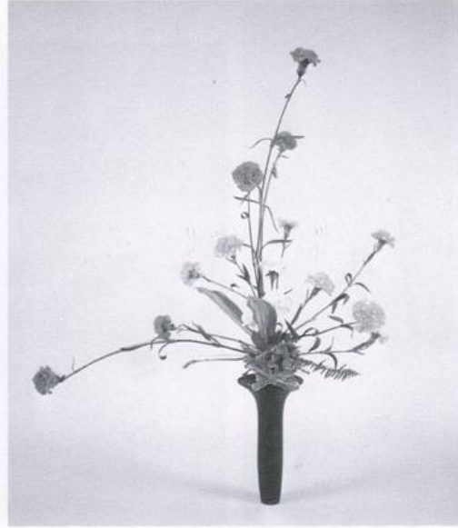
◦ Gertrude Mender (Austria)