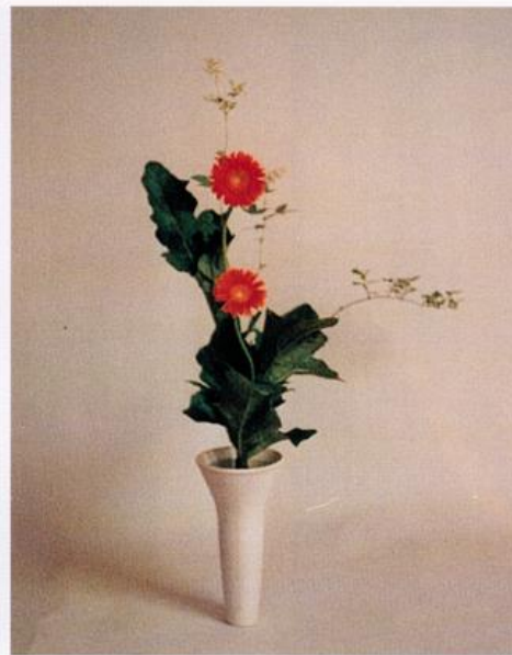
◦ Rita Caviezel