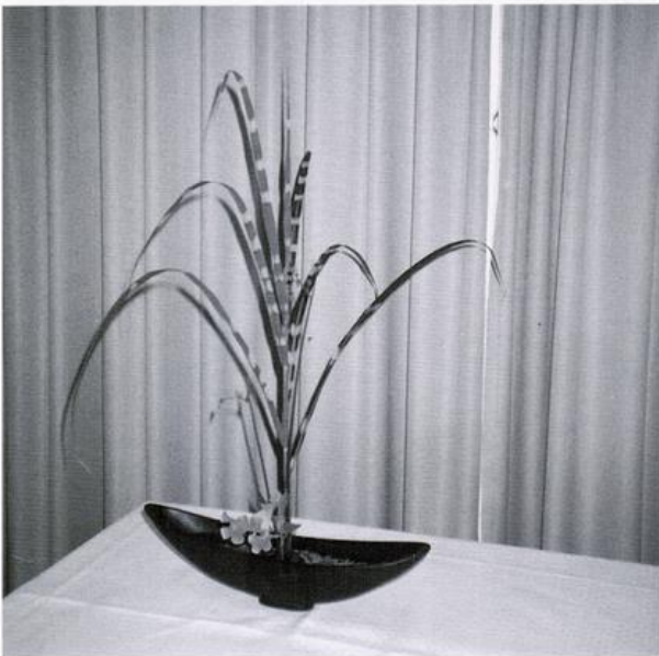
◦ Arlette Faude