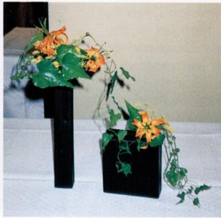
◦ Myriam Isler